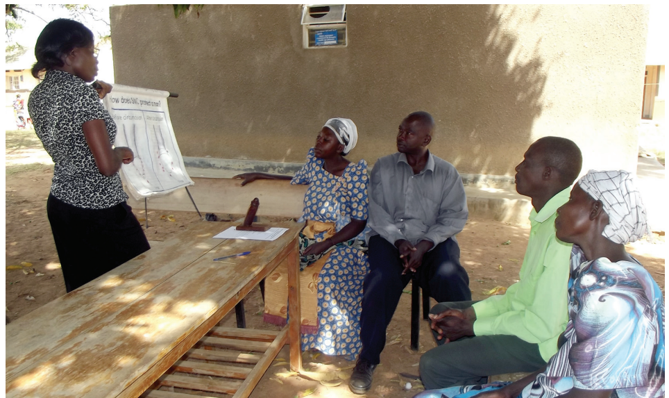
Couples attending a group VMMC education session in Uganda.

Addressing the different needs, constraints, and opportunities of men, women, girls and boys is critical to any quality improvement effort. Implementing improvement interventions without considering gender dynamics risks failing to reach half of the population and unintentionally exploiting or harming one gender. From an implementation perspective, this is an inefficient use of resources. From a quality improvement standpoint, it jeopardizes patient-centeredness, safety, and equality. Through strategic integration of gender into improvement planning, implementation, and documentation, we can respond to differences between women, men, girls, and boys to achieve sustained and equitable improvement.