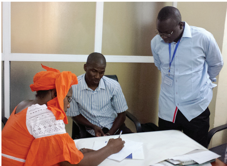
ASSIST Mali staff work together during a gender training.

In Mali, ASSIST's gender analysis identified gender-related issues affecting the achievement of their maternal and child health-related project objectives, as well as opportunities to leverage. For example, the improvement team found that husbands and mothers-in-law often decided whether or not a woman needed to go to the health facility, rather than the woman herself. Yet, both husbands and mothers-in-law had little accurate knowledge about health. Therefore, the team realized the importance of targeting family members in addition to mothers themselves with health education to improve maternal and child health outcomes. Topics included the importance of antenatal care, delivering at a facility, and post-partum family planning. The