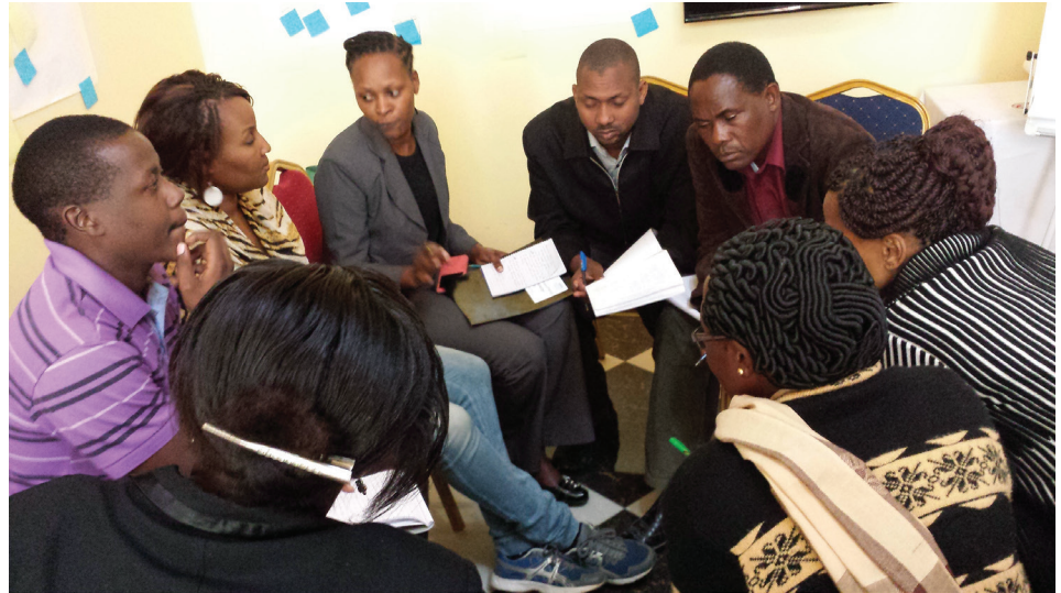
Teams from Kenya and Tanzania engage in small group discussion.

When a tested change leads to an improvement, the next step is to spread the change to other sites to scale up the effective gender-related activities. It is important to identify any new gender-related issues or differences in the new community in which the scale up will occur. However, gender issues might be different in different communities even in the same country; if such differences exist, they must be taken into consideration so that the scale up is not adversely affected.